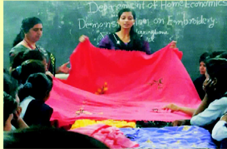
Embroidery work by Dept. of Home Economics