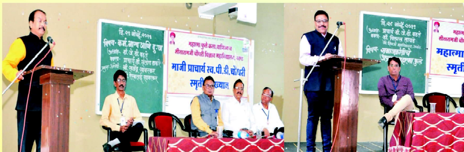
Late P. D. Chaudhari Smriti Vyanthanmala- 28 - 30 Nov. 2019