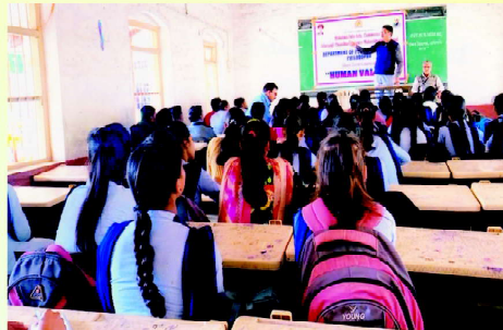
Guest Lecturer Orgd. by Dept. of Philosophy & Pol. Sci. 6 Jan. 2020