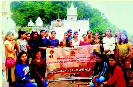
Excursion organized by Dept. of Mathematics 14 Feb. 2020