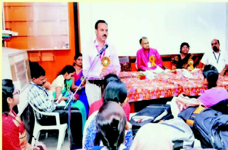
Work Shop on Mushroom Cultivation by Dept. of Botany- 26 Sept. 2019