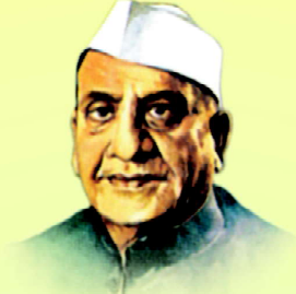
Dr. Panjabrao alias Bhausaheb Deshmukh Founder President of Shri Shivaji Education Society, Amravati