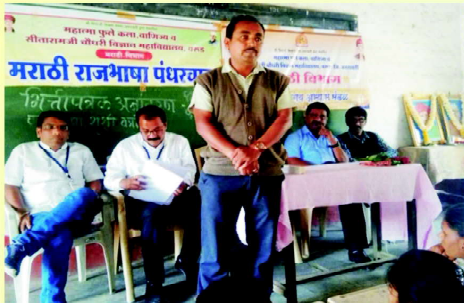
Marathi Rajbhasha Din Pandharwada Celebration