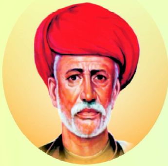
Mahatma Jyotiba Fule (1827-1890)