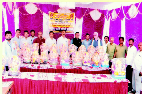
Eco-friendly Lord Ganesha Stall- 29 Aug. 2019