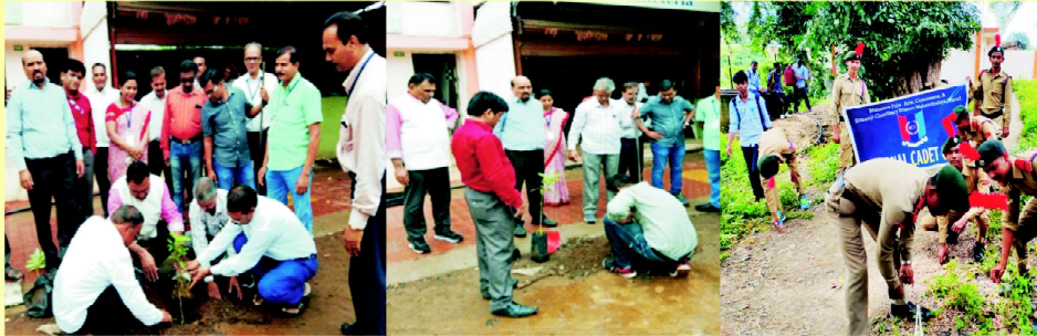
Tree Plantation week 1 - 7 July 2019