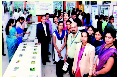
Regional workshop on Ethnobotany- 13, 14 Dec. 2019