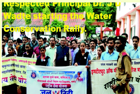
Water Conservation Rally- 21 st August 2019