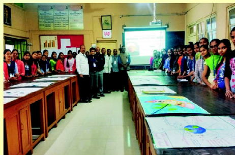
Poster Exhibition on National Science Day (Dept. of Physics)