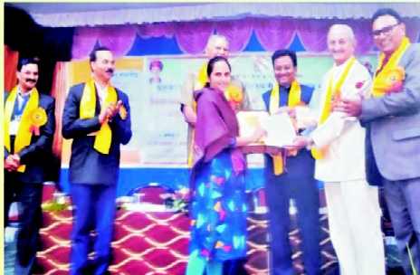
Degree Distribution (Part of Convocation-2019-20)