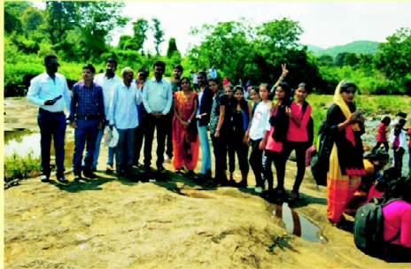
Excursion organized by Dept. of Zoology at Nagthana